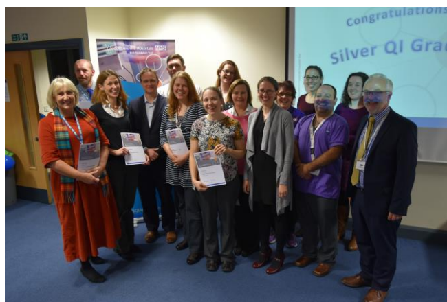
Our Silver Improvement Practitioners with members of the Academy Faculty

Details of their Quality Improvements can be found on the Academy website http://www.gloshospitals.nhs.uk/en/Wards-and-Departments/Other-Departments/GSQIA/GSQIA-Awards/